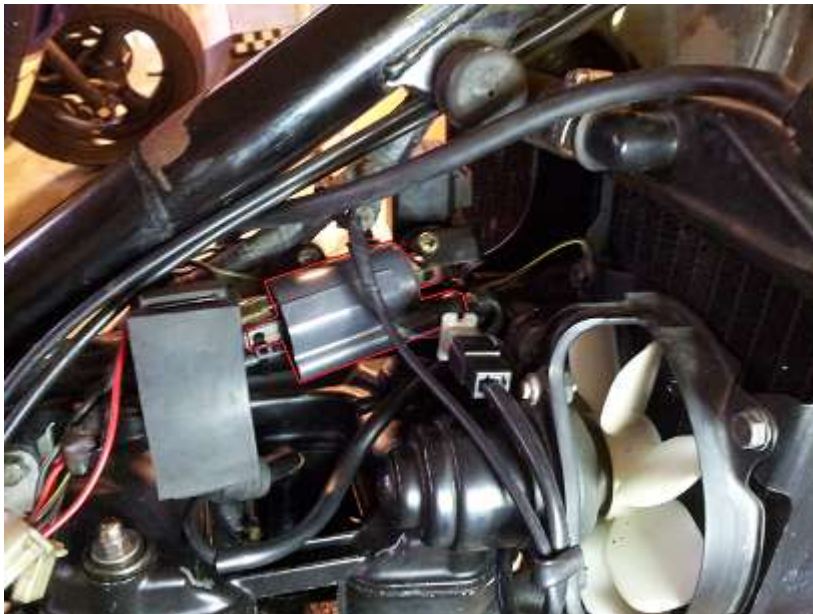
location of the ignition coil, under the fuel tank.

- Since this is a TCI ignition coil, one side has to be attached to 12 Volt . You can do this by attaching the red wire to the + pole of the battery. Then attach the other side of the wire to the pin of the TCI ignition coil with a “ + “ sign next to it.